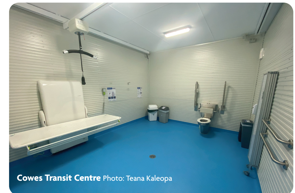
Cowes Transit Centre